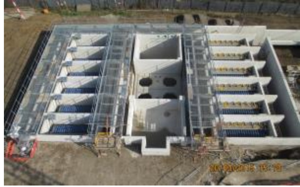
Aerial view of filter stage during construction